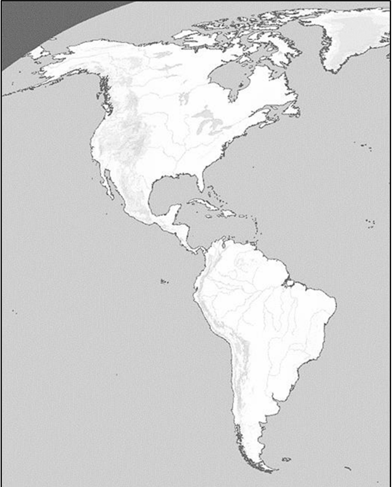
Map #1 - Western Hemisphere